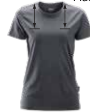
Placements 1 and 3