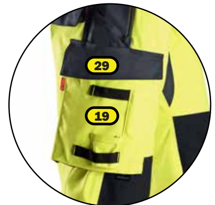
Right side of trouser