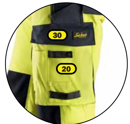
Left side of trouser